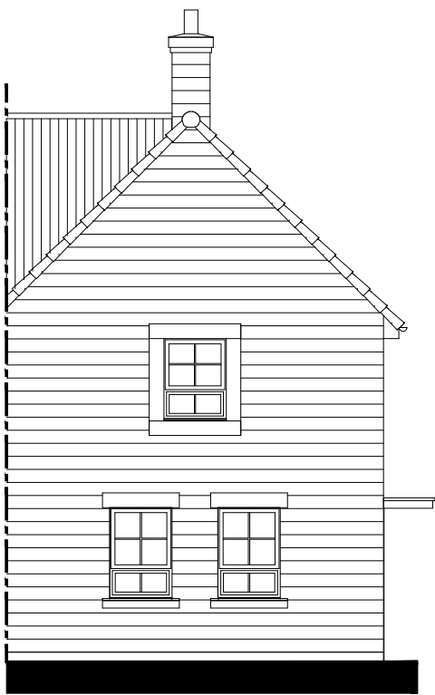
FRONT ELEVATION 2