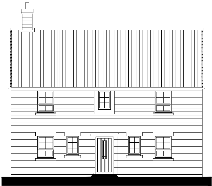
FRONT ELEVATION 1